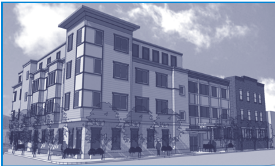
An architect's rendering of the new Hope House shows a blend of old and new. An existing warehouse will be renovated and connected to a new four-story structure with an entrance on Farnham St.

When completed, the new Hope House (continued on back page)